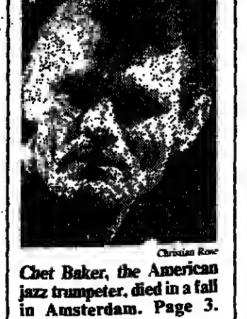
Chet Baker, the American jazz trumpeter, died in a fall in Amsterdam. Page 3.

AMRITSAR, India — Indian paramilitary forces entered the Golden Temple complex Friday evening and took over two strategic buildings a few hours after Sikh militants had rejected a demand to release women and children.